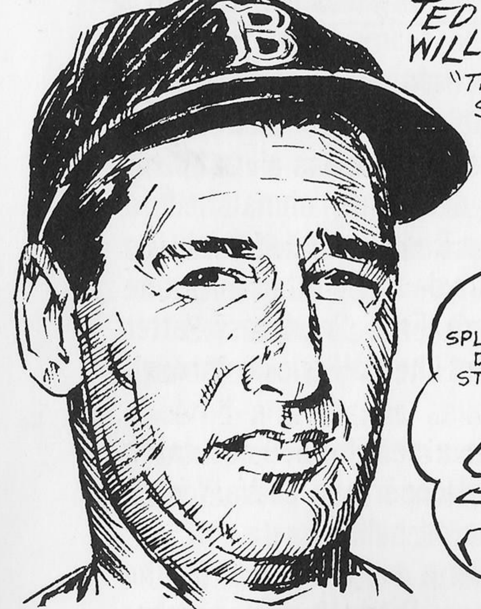
TED WILLIAMS "THE SPLENDID SPLINTER" WENT 4-FOR-4 WITH TWO HOMERS IN '46 ALL-STAR GAME

WILLIAMS MADE HEADLINES IN GAME 3 OF '46 WORLD SERIES WHEN HE BUNTED AFTER CARDINAL MANAGER EDDIE DYER PUT MOST OF HIS TEAM ON RIGHT-FIELD SIDE OF DIAMOND